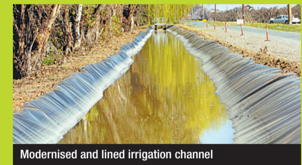
Modernised and lined irrigation channel

75,000MI annually. The cost of the pipe is not part of the $1 billion announced by the Victorian Government.