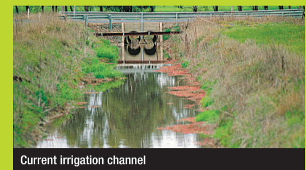
Current irrigation channel

Under the project, a pipe will be built to send Melbourne's share of the water from the Goulburn River north of Yea to Sugarloaf Reservoir where it will be treated for urban use. The pipe will be transferring an agreed maximum of